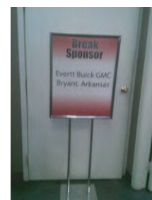
Sign Frame RENTAL with graphics. Can be single-sided or double-sided. (1) single - $60.00 (2) double - $70.00 rental/advanced order

We have a wide variety of items we can customize including meter panels, banners, floor stickers, counters, displays, walls, booth decor and backdrops for themed shows. We can do all of your printing needs in-house. Give us a call for any special items you may need. We will print and deliver to your booth, so once you approve your order your all set! We also do pillowcase backdrops and graphic walls with advanced orders!