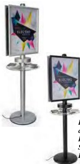
Double sided or single sided charging stations. RENTAL In black or silver. Single $180.00 Double $250.00