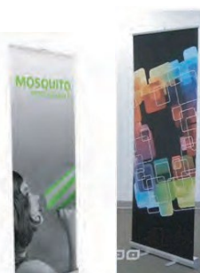
Retractable Banner Stand Can be used over and over. Easy set-up. Graphics included in price. 32" x 82" Includes Carrying Case $185.00