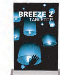
Retractable Mini table top Banner Stand Can be used over and over. Easy set-up. Graphics included in price. 11" x 17" $40.00

ALL CANCELLATIONS FOR ITEMS ORDERED MUST BE MADE 5 BUSINESS DAYS BEFORE THE EXHIBITOR MOVE IN DATE TO RECEIVE A FULL REFUND. ITEMS CANCELLED AFTER THE 3 BUSINESS DAYS BUT BEFORE THE EXHIBITOR MOVE IN DATE WILL BE SUBJECT TO A RESTOCKING FEE OF $25.00. ANY ITEMS DELIVERED TO THE SHOW SITE OR ITEMS REQUESTED TO BE REMOVED BY THE SHOW REPRESENTATIVE FOR ANY REASON WITHOUT PRIOR CANCELLATION WILL BE CHARGED AT FULL PRICE EVEN IF REFUSED AT BOOTH.