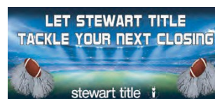
Our 2' x 6' booth horizontal banner can hang on the back of your booth. Single-sided with grommets for hanging. Banner material is heavy duty 13oz. Can be reused over and over. $95.00